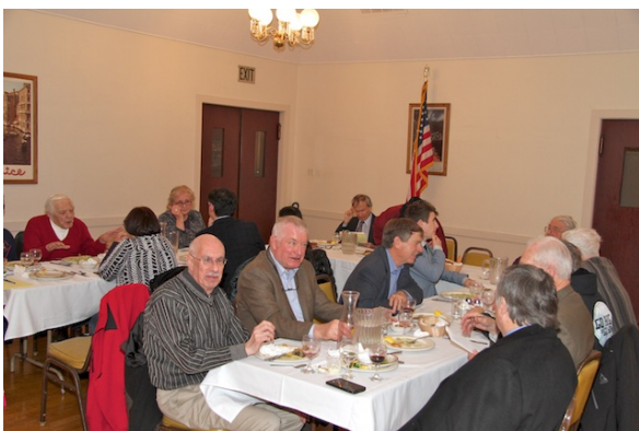
Members, judges, and guests waiting between contestants.

The contest began with the reading of a few rules, how the contest works, and then went directly into the contest.