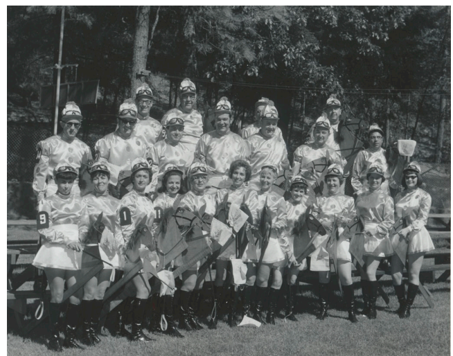
Members of the GE Lions dressed as Jockeys for a District Convention at Hobergs in the 1960s