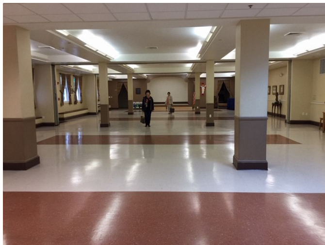
A partial view of the possible new Crab Feed venue at St. Phillip's Church.