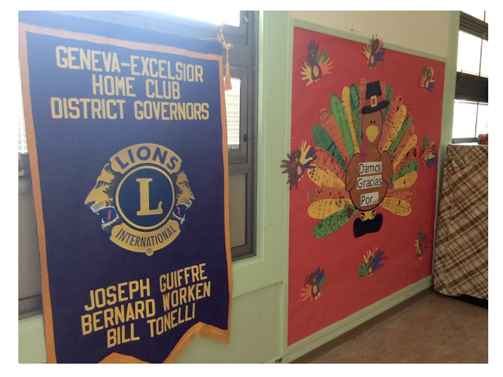
Our Club Banner set in place before students arrive for their thanksgiving luncheon.

Held Thursday, November 21st from 9:30 a.m. to 1:00 p.m. Mission Education Center 1670 Noe Street @ 30th Street