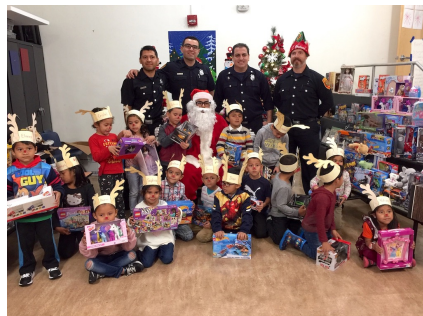
One of the school classes proudly posing with Santa and members of Los Bomberos Firefighters after receiving their gifts from Santa.