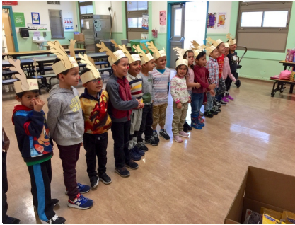
Children lining up and preparing to sing a song for Santa.