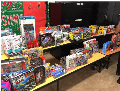
Some of the gifts on display ready to be given by Santa to the 200 students in the school.