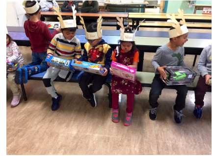
A few of the 200 students comparing their gifts from Santa.