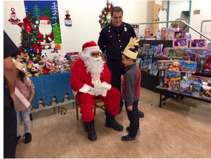
One of the 200 students talking with Santa just before receiving his gift from Santa.