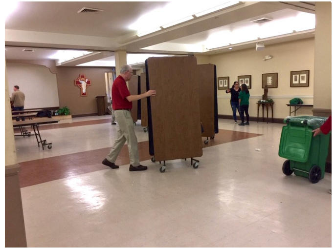
The end is very near in this photo; the clean up process went very quickly with the help of members and guests.