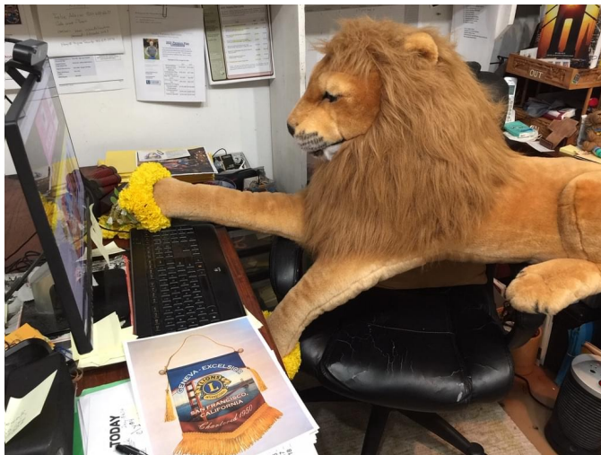
Leo the Lion at the meeting.