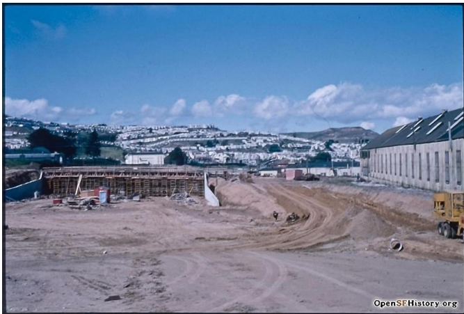
1963 - From Facebook & OpenSFHistory.org - Hwy 280 under construction at the Geneva Avenue exit; looking north.