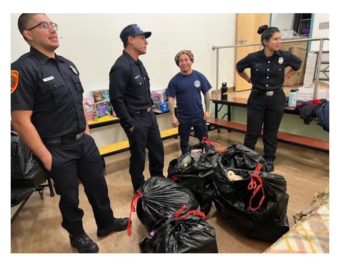
Members of Los Bomberos, with a little help, hae brought in presents for the children.

A little boy shows off his new Iron Man for others.