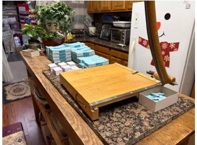
Stub cutting operation with about 1/3 of the books already cut. 6 1/2 hours to cut 1255 books.

The final numbers are in and we were able to add $5,268.02 to our activities fund. Pretty good for the 38.28 hours, or so, spent on the raffle. Thanks to all who participated, helped, and did something to contribute. On to next year.